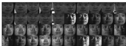
Fig. 2. Samples from the CMU PIE database.