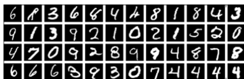
Fig. 1. Samples from the MNIST database.